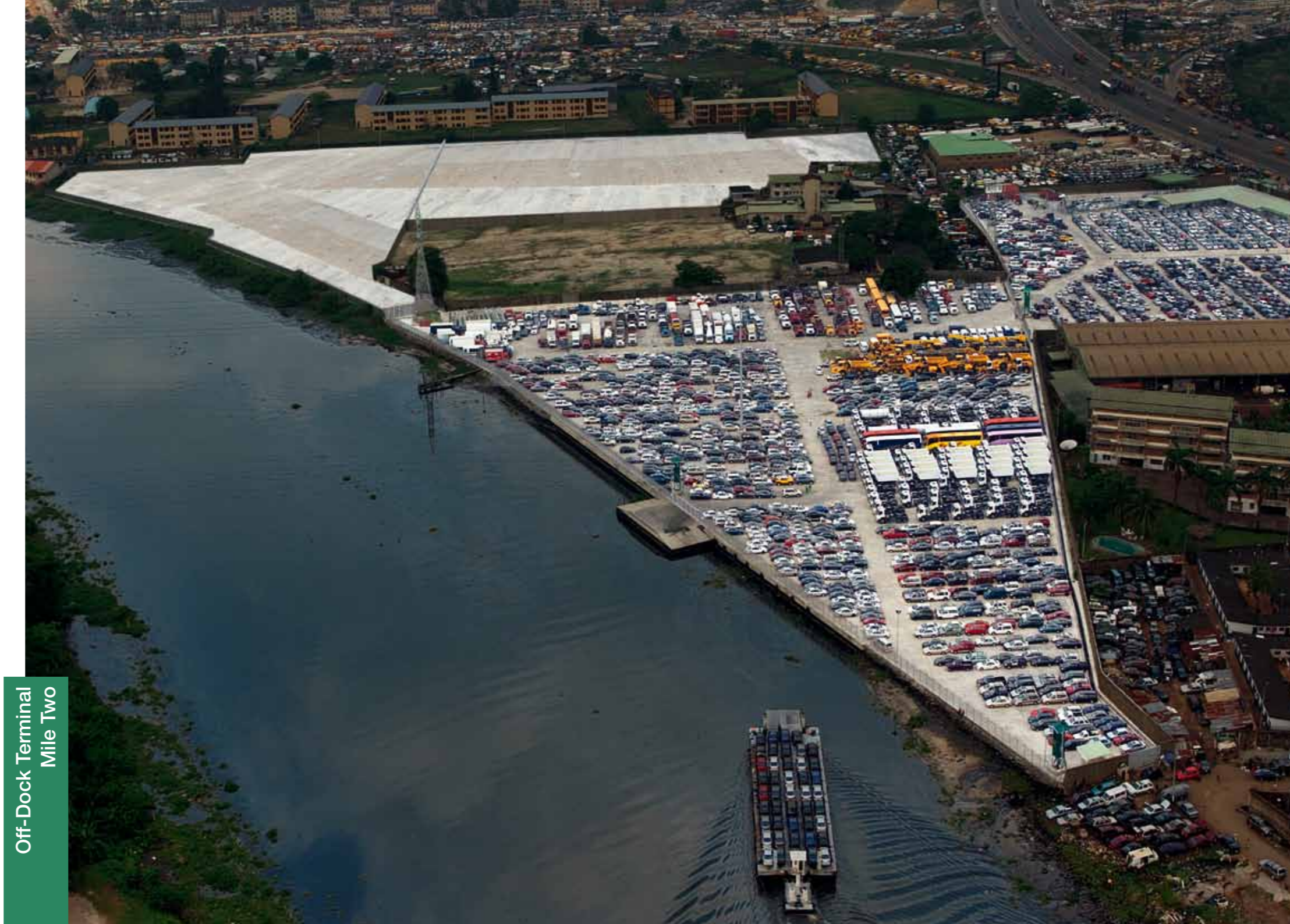
Off-Dock Terminal Mile Two

As a leading dedicated terminal operator with a talented work force and state-of-the-art facilities specifically designed to serve the Ro-Ro Trade, PTML is uniquely positioned to offer the most efficient services to Nigerian Importers and Exporters.